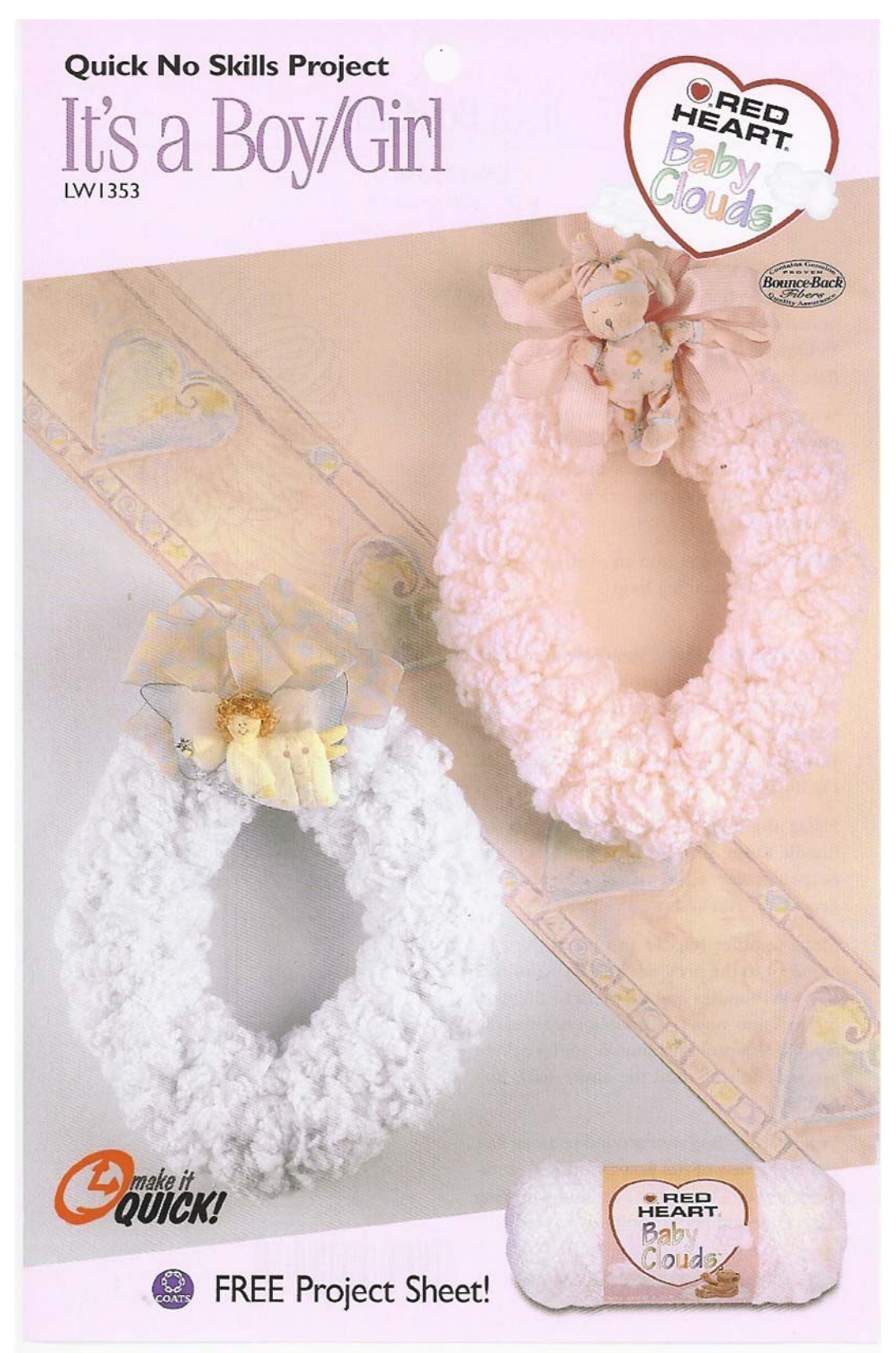
Coats & Clark yarns and crochet threads are available at PurpleKittyYarns.com